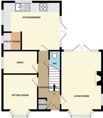
GROUND FLOOR 699 sq.ft. (65.0 sq.m.) approx.